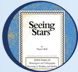
Seeing Stars for Phonemic Awareness, Reading, and Spelling (SI)