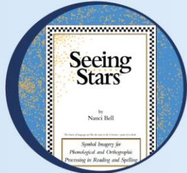
Seeing Stars for Phonemic Awareness, Reading, and Spelling (SI)