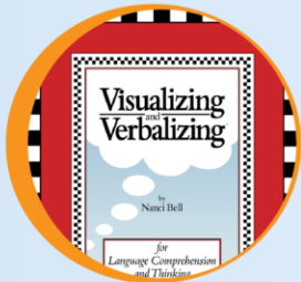
Visualizing and Verbalizing for Language Comprehension and Thinking (V/V)