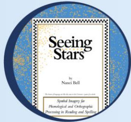
Seeing Stars for Phonemic Awareness, Reading, and Spelling (SI)