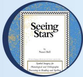
Seeing Stars for Phonemic Awareness, Reading, and Spelling (SI)