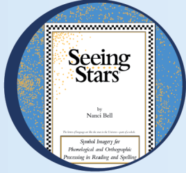
Seeing Stars for Phonemic Awareness, Reading, and Spelling (SI)