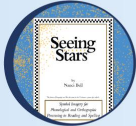
Seeing Stars for Phonemic Awareness, Reading, and Spelling (SI)