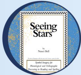
Seeing Stars for Phonemic Awareness, Reading, and Spelling (SI)