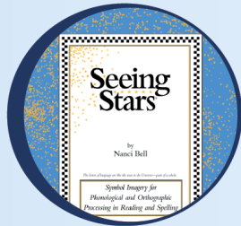
Seeing Stars for Phonemic Awareness, Reading, and Spelling (SI)