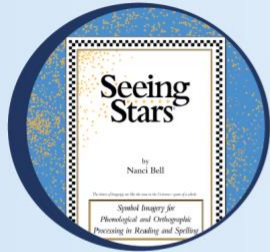
Seeing Stars for Phonemic Awareness, Reading, and Spelling (SI)