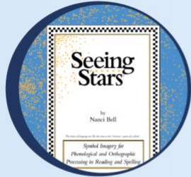
Seeing Stars for Phonemic Awareness, Reading, and Spelling (SI)