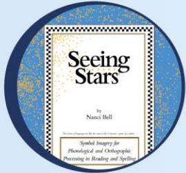
Seeing Stars for Phonemic Awareness, Reading, and Spelling (SI)