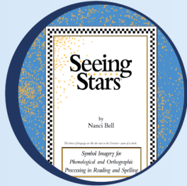
Seeing Stars for Phonemic Awareness, Reading, and Spelling (SI)