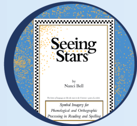
Seeing Stars for Phonemic Awareness, Reading, and Spelling (SI)