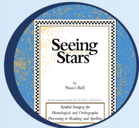
Seeing Stars for Phonemic Awareness, Reading, and Spelling (SI)