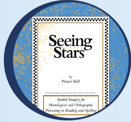
Seeing Stars for Phonemic Awareness, Reading, and Spelling (SI)

PROFILE: Special Education Students – End-of-Year Results