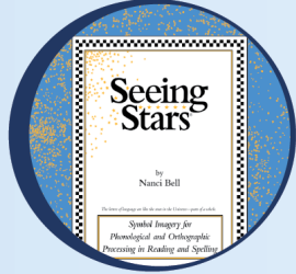
Seeing Stars for Phonemic Awareness, Reading, and Spelling (SI)