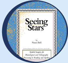
Seeing Stars for Phonemic Awareness, Reading, and Spelling (SI)