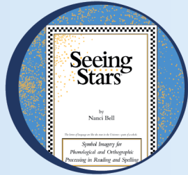
Seeing Stars for Phonemic Awareness, Reading, and Spelling (SI)