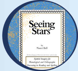
Seeing Stars for Phonemic Awareness, Reading, and Spelling (SI)