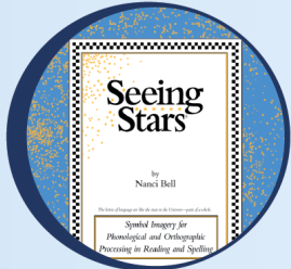
Seeing Stars for Phonemic Awareness, Reading, and Spelling (SI)